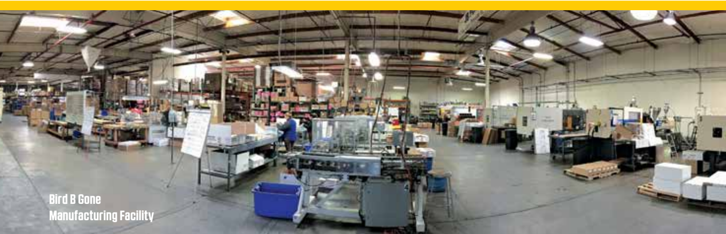
Bird B Gone Manufacturing Facility