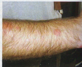
24 hours after the bites.

Courtyard Times Square Stay in the heart of Midtown NYC at Great low rates