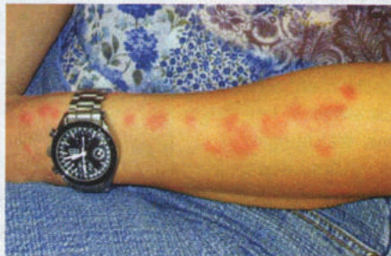
24 hours after the bites.